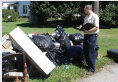
City Inspector Assessing Nuisance Complaint

If you have questions regarding the city's efforts to promote public health please contact the Health Department at 778-2060.