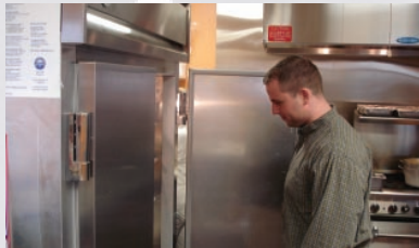
Sanitarian Inspects Restaurant Facilities