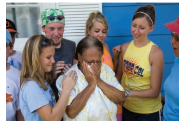
Workcamp crew saying Farewell to homeowner