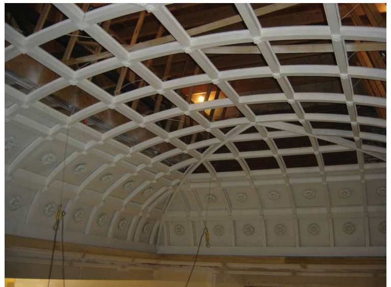
Frame for Skylight to be Installed